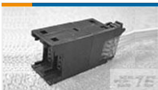
TE Part # 5-1473574-4 RITS.JUNCTION BOX 4D 4P F/H