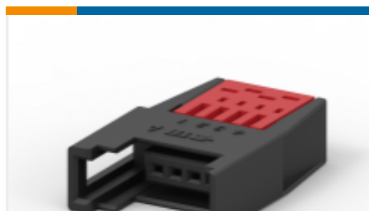
TE Part # 1-2295321-4 RITS CONN. SOCKET ASSY 4P RED TIN