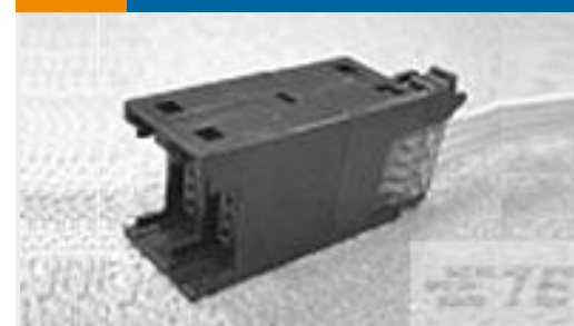
TE Part # 1473574-4 RITS.JUNCTION BOX 4D 4P P/M